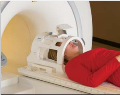
If you are having a High-Field MRI of your Head or Brain.

How you will be positioned outside of the High-Field MRI for various scans utilizing coils to capture superior images: