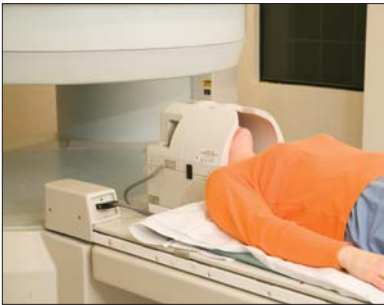
If you are having an Open MRI of your Head or Brain.

How you will be positioned outside of the Open MRI for various scans utilizing coils to capture superior images: