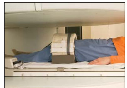
Position you will be in for an Open MRI of the Knee. This positioning would also be true for an Open MRI of the Foot or Ankle.