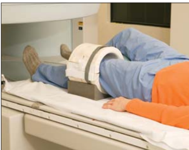
If you are having an Open MRI of your Knee.