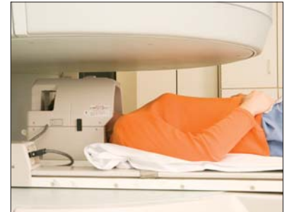
Position you will be in for an Open MRI of the Head or Brain.

How you will be positioned inside of the Open MRI for the same scans: