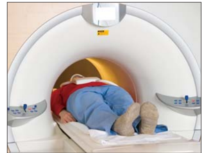
Position you will be in for a High-Field MRI of the Cervical Spine. Also would be true for a High-Field MRI of the shoulder.