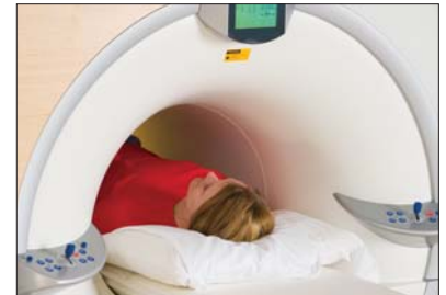
Alternate position you will be in for a High-Field MRI of the Lumbar Spine or Thoracic Spine. This positioning would also be true for a High-Field MRI of the wrist.