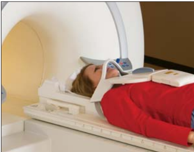
If you are having a High-Field MRI of your Cervical Spine.