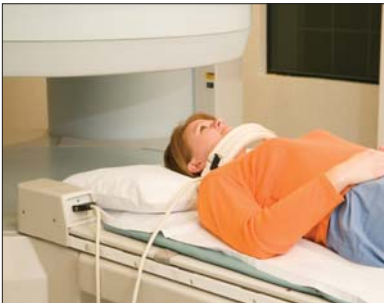
If you are having an Open MRI of your Cervical Spine.