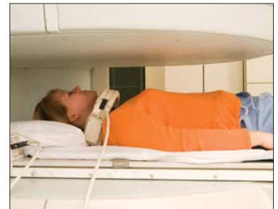
Position you will be in for an Open MRI of the Cervical Spine. Also would be true for an Open MRI of the shoulder.