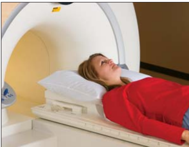
If you are having a High-Field MRI of your Lumbar Spine or Thoracic Spine.

The photos and captions in these two columns will help to give you a better idea of what you will encounter when having your High-Field MRI at a Dr. Hill & Thomas Co. Outpatient Imaging Center. We hope that this will put your mind at ease and dispel any misconceptions with regards to just what to expect.