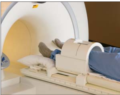
If you are having a High-Field MRI of your Knee.